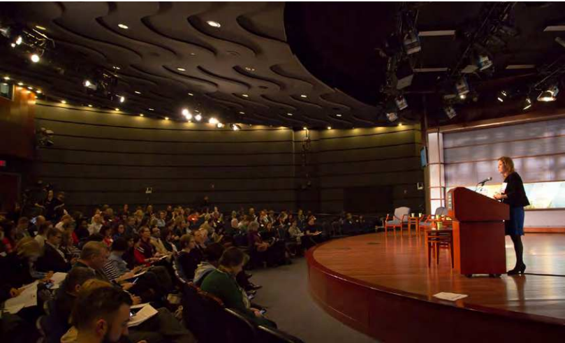
Danielle Nierenberg, Food Tank. Photo at the 2015 Food Tank Summit by Hadley Jordan.