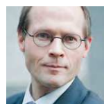
Olivier De Schutter