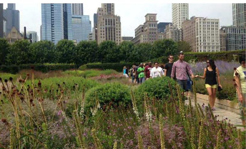
Food Tank Tours August 2014