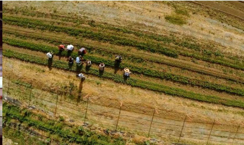
Food Tank, in partnership with Greener Media, is excited to announce the world premiere of award-winning documentary “Man in the Maze.”