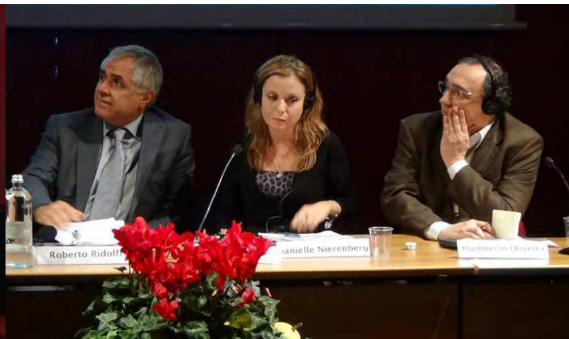
Family Farming Against Hunger and Poverty in Turin, Italy

food system dominated by industrial animal production. Industrial animal operations already account for the vast majority of animal production in the United States, and are responsible worldwide for 67 percent of poultry production, 50 percent of egg production, and 42 percent of pork production. A rapidly growing industry – 80 percent of growth in the global livestock sector is from industrial animal operations or factory farms – its sheer size and intensity are key drivers behind a whole range of environmental problems.